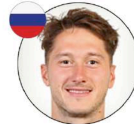
Anton Miranchuk FC Lokomotiv