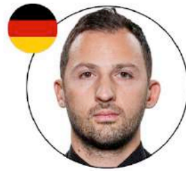
Domenico Tedesco Ex-coach of the FC Spartak Moscow